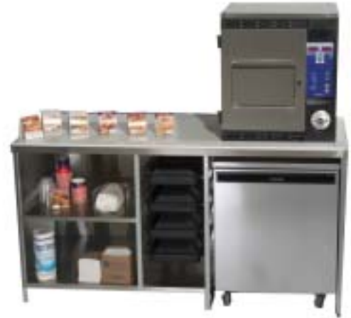
The "perfect partner" to our VF-3 ventless fryer and 6' utility table (shown above).