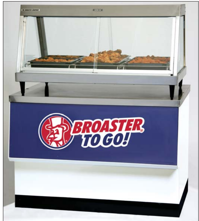
GRHD-3P with stainless steel finish (shown with optional pass-through doors and 4' metal module base cabinet).

* optional designer colors are not retrofittable